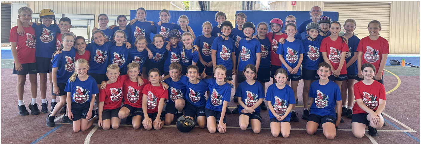
Congratulations to our Pogo Pulse & Skipping Teams who performed their demo on Wednesday.