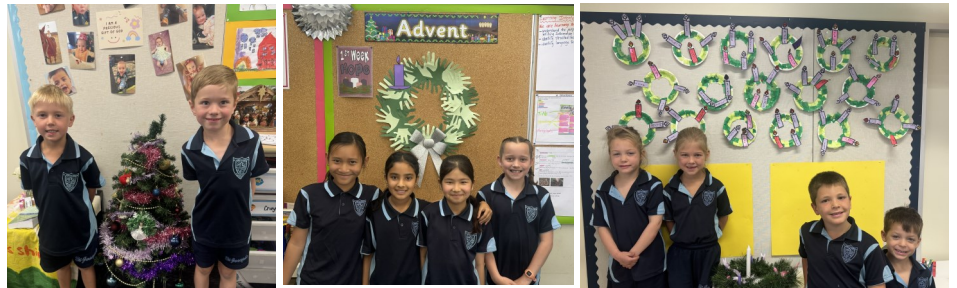
Advent around our school .....

Last week was the final Transition Day for our 2025 Reception students. This was another successful day with so many memorable learning experiences. We received positive feedback about our whole Transition Program including the excellent Buddy Program. It is affirming, as Principal, to know that what we do with children and young people to support a positive start to schooling is effective. I congratulate all our Reception Staff, Year 5 buddies and all our new parents/carers for their support, commitment, enthusiasm and preparation.